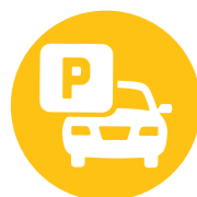
MAIN CAR PARK AREA