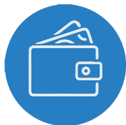
TOP UP POINT