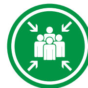
EMERGENCY ASSEMBLY POINT