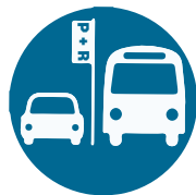
PARK & RIDE AREA